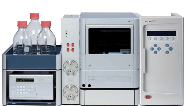
Figure 1: ALEXYS Kanamycin and Amikacin Analyzer

Kanamycin and amikacin are closely related, water soluble, broad spectrum aminoglycoside antibiotics. Kanamycin is obtained from Streptomyces kanamyceticus . Amikacin is synthesised by acylation of an amino group of kanamycin A with L(-)-g- amino- \alpha - hydroxybutyric acid (LHABA). Both antibiotics can be analysed using ionexchange chromatography in combination with pulsed amperometric detection [1-4].