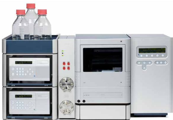
Figure 1: ALEXYS Aminoglycosides analyzer for Spectinomycin.

The ALEXYS® 'Aminoglycosides analyzer' is a dedicated LC solution for the analysis of Spectinomycin, which matches the EP requirements for peak resolution and repeatability of the principal peak. The European Pharmacopoeia, 6.0, (2008), 2947-2949 was used as a basis to set-up this method. In this application note typical results obtained with the Aminoglycosides analyzer are reported demonstrating its performance for the analysis of impurities in Spectinomycin bulk drugs.